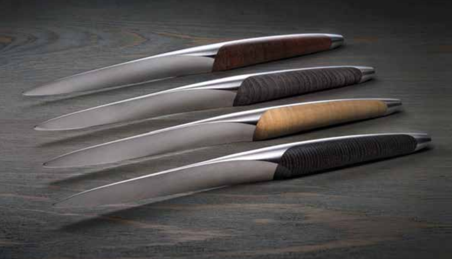
Table knife set – CHF 956.00 (walnut , grey, light and dark ash)

In addition to the black ash and walnut standard versions we also offer an assorted set of 4 table or steak knives with 4 different wooden handles.